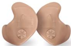
CIELO 2 ITE