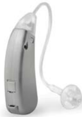
CIELO 2 Life