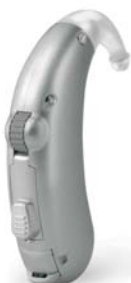
CIELO 2 P